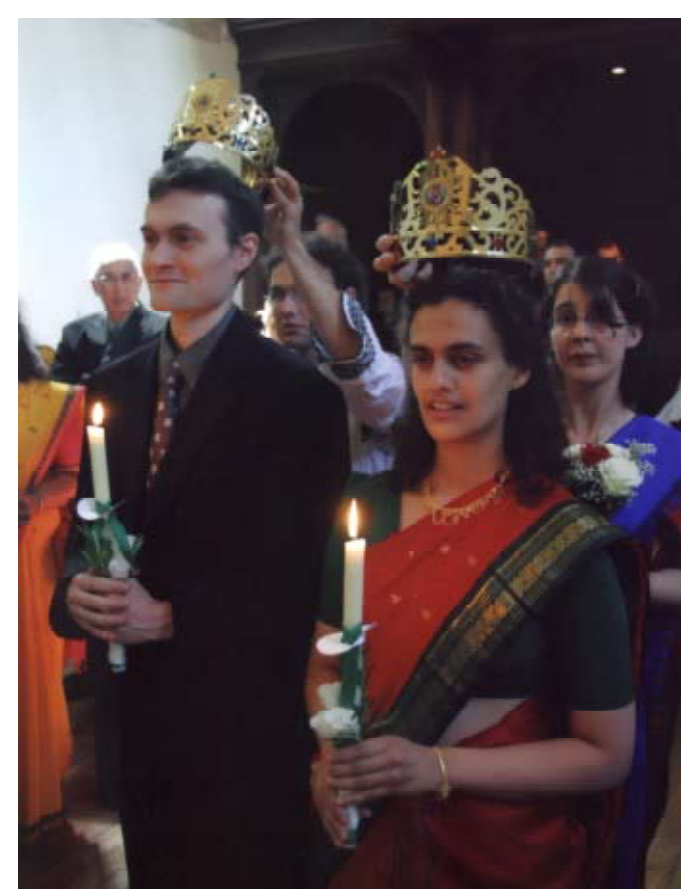
The Crowning at Marriage

The Mystery restores marriage to what it is intended to be.