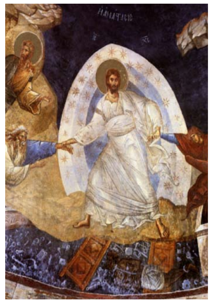
The Risen Christ restores us to full humanity, drawing Adam and Eve from sin, separation, and death Parecclesion of the Church of the Holy Saviour in Chora, Constantinople (Istanbul) c.1340