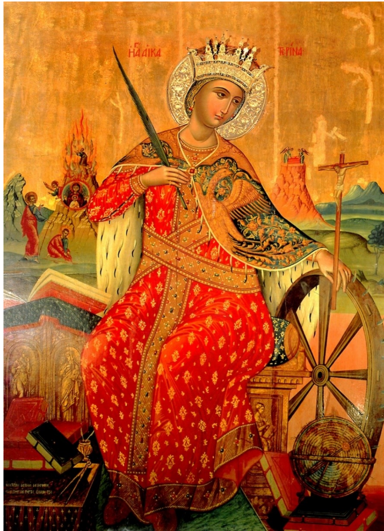
Saint Catherine, Patron of the Institute for Orthodox Christian Studies

English translation of the text of the service from: http://www.goarch.org/chapel/liturgical_texts/lesser_water (with adaptations)