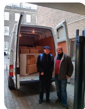
All the Institute's staff took part in the move from Wesley House over to the Institute's new building, Palamas House