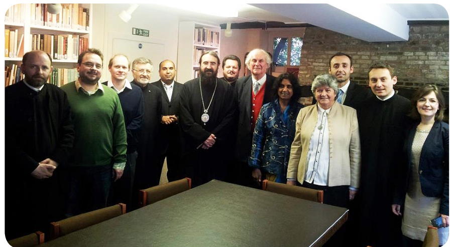
The Institute was delighted to receive in May a visit from one of its Bishops, the Romanian Metropolitan Iosif, at our new home