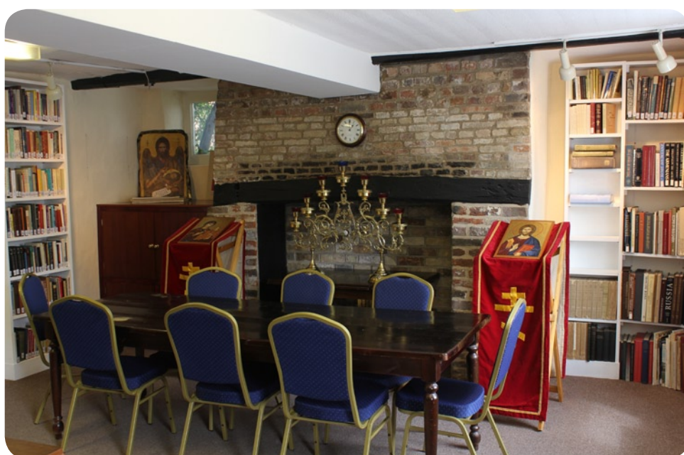
The former Board Room at Palamas House, soon acquired an Orthodox look as it became the new library/seminar room of the Institute!