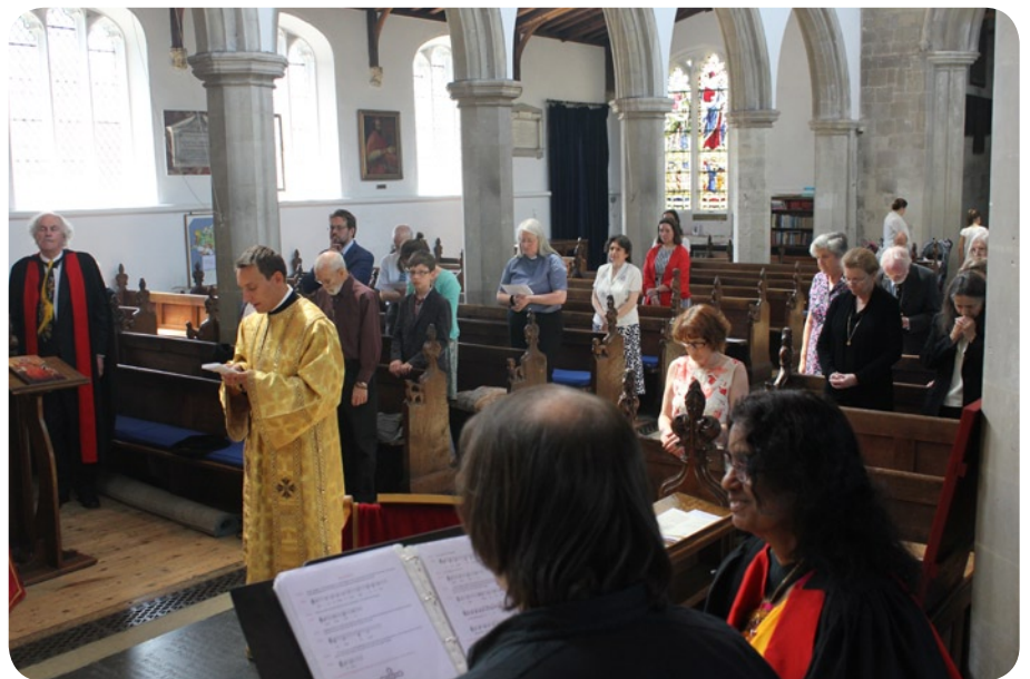
The Formal Opening of Palamas House, 6 July 2013: 'A day that the Lord has made: let us rejoice and be glad in it!'