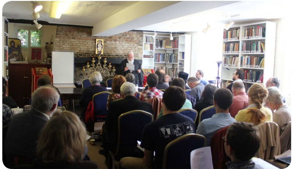
Metropolitan Kallistos Ware lecturing on Gregory of Nyssa in our new Library/Lecture Room

the fact that, since March many events have been organised here and received by enthusiastic participants. We have had so far our Community Days, an Icon Painting workshop, several meetings with Orthodox bishops who came to visit us in our new home, research seminar meetings and youth meetings. Moreover, much of the teaching for our MA courses run jointly with the Cambridge Theological Federation has been done in our Library/Seminar Room. Palamas House is set to host similar teaching events in the future as well as being the venue for our own courses and seminars at both undergraduate and postgraduate level, and also for many of the courses taught within the Cambridge Theological Federation by our fellow theological colleges.