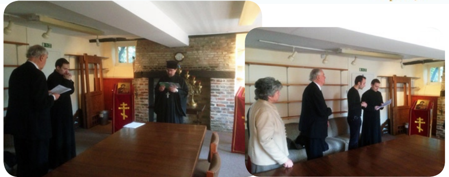
The Institute's first service in its new home on 7 February 2013

As you will see from the photographs, Palamas House is an imposing eighteenth-century, three-storey, brick building under a tiled mansard-style roof. The property occupies a prominent position on Chesterton High Street, approximately one mile east of the historic city centre of Cambridge. A large circular courtyard at the rear, with a lawn and majestic trees, offers adequate parking and an attractive garden - altogether a delightful accompaniment to a handsome edifice, giving the entire ensemble the air of a 'mini-college.' Testimony to the great need for an Orthodox centre like Palamas House in Cambridge is